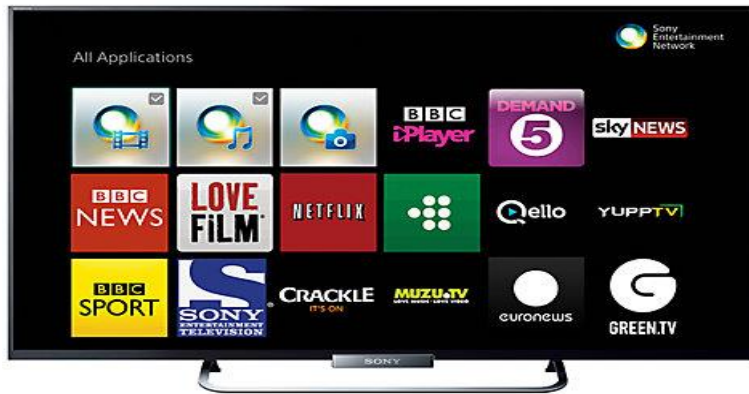
Smart TV apps