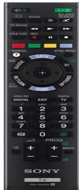
Sony Remote Control

To use Amazon TV (to link to your i-pad/i-phone/laptop/i-tunes/Netflix etc), select the INPUT ( top left) button on the Sony remote control and then use the Amazon TV remote.